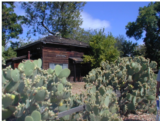
Historic Casino Building at Jose Higuera Adobe

The itinerary of the tour's locations and meeting times for each place will be sent out in a bulletin to Society members in mid-June and will be available to everyone else through an announcement in the Milpitas Post . The tour is free and open to all.