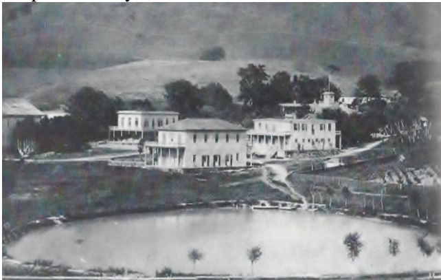
Warm Springs Resort in 1860

The meeting will be held on Wednesday, June 10 th at 7 pm in the Community Room (auditorium) of the Milpitas Library, 160 N. Main Street.