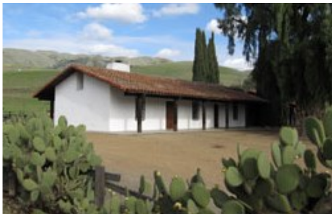
Jose Higuera Adobe

The Milpitas Historical Society's annual historical tour will be held on Saturday, June 20.