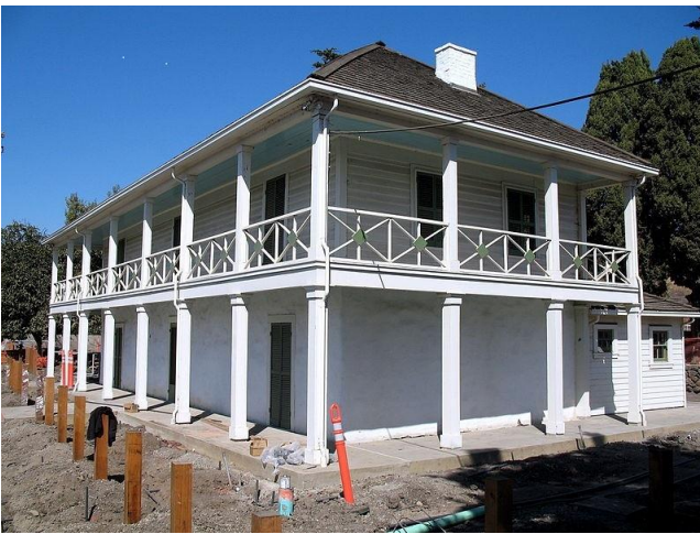
Alviso Adobe undergoing renovations last fall

If you've been wondering, you'll be able to satisfy your curiosity at the January meeting of the Milpitas Historical Society, on Wednesday, January 9, 7:00 pm.