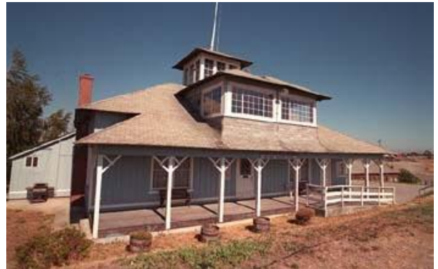
1903 South Bay Yacht Club in Alviso

The historic South Bay Yacht Club building, shown in the photo to the right, dates from 1903, and has suffered its own share of adventures.