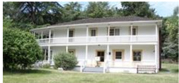
The Martinez Adobe