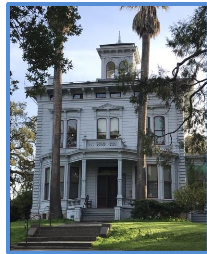
The John Muir House in Martinez

Club, we can all enjoy our country's scenic and historic wonders to this day.