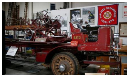
A 1914 American LaFrance 85-foot Aerial Ladder Truck is one of the pieces of the 55 rolling stock collection of restored antique firefighting equipment memorabilia at the San Jose Fire Museum

The Fire Museum has restored numerous rare and antique fire apparatus dating from 1800 through the late 1950s.