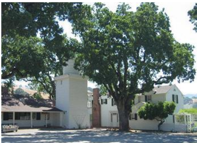
Grant Ranch Cook House, Tank House and Farm House