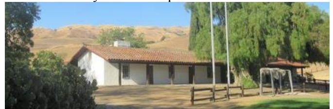
Jose Higuera Adobe

The tour begins with a discussion of the Society's exhibit of Milpitas historical items at the Great Mall, after which everyone will board the bus to visit sites along historic Main Street (the former Mission Road). After this, the tour will visit two historic adobes -- the Jose Higuera Adobe on North Park Victoria Drive at Wessex Place, and the Jose Alviso Adobe on Piedmont Road. After this, the bus will make a short jaunt to the two final sites so that participants can choose to visit either the 1902 St. John the Baptist Catholic Cemetery (where many pioneers are buried) or the 60-year-old working Silva apricot ranch to learn how apricots are processed. Finally, the bus will bring everyone back to the Great Mall by about 1:30 pm.