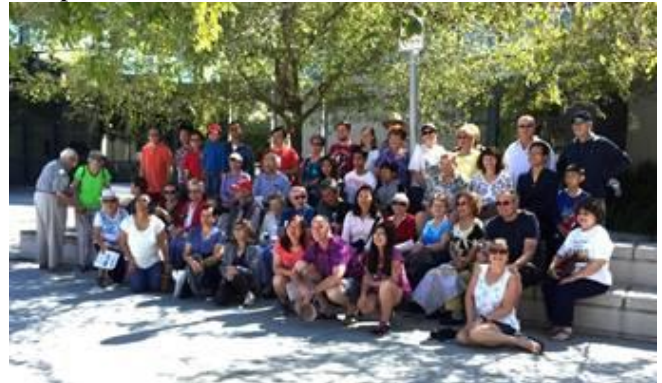
2016 tour group in front of the Milpitas Library

Check-in for the tour is 9 am in the Milpitas Public Library garage on 160 N. Main Street; the tour will end at 2 pm.