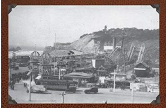
Playland under construction in 1919

The topic will be one of America's landmark amusement parks, Playland at the Beach, a glamorous park that is still revered by San Franciscans more than 40 years after it closed in 1970. Playland opened in 1920 and its pioneering attractions inspired the designers of the many amusement parks that followed.