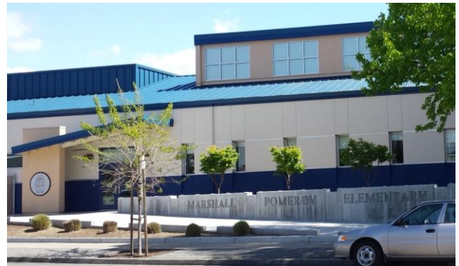
Marshall Pomeroy School