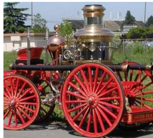
"The Engine that Saved San Jose"

On Saturday, September 21, Milpitas Historical Society members were treated to an interesting tour of the Fire Museum at 201 N. Market Street, San Jose, next to San Jose Station 1. This original building was one of the earliest fire stations in San Jose, and contains many historic firefighting vehicles and wagons, including "The Engine That Saved San Jose" after the great earthquake of 1906.