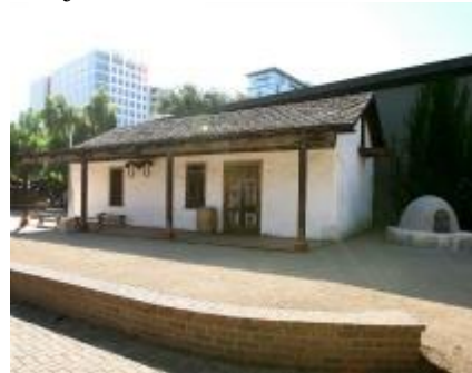
The Peralta Adobe