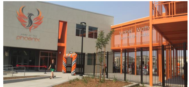
Mabel Mattos Elementary School