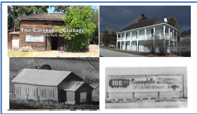
Many touchstones of Milpitas history will be part of the video history presentation at the meeting

We really want to see you there! As well as taking our yearly vote for the new board of directors, as well as enjoying the video presentations on Milpitas history! There