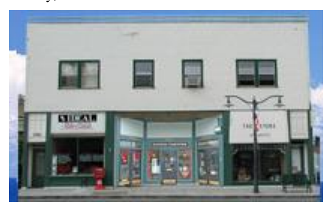
The Niles Essany Film Museum

The next meeting of the Milpitas Historical Society will be held on Wednesday, November 13, at 7:00 pm in the Community Room (auditorium) of the Milpitas Library, 160 N. Main Street.