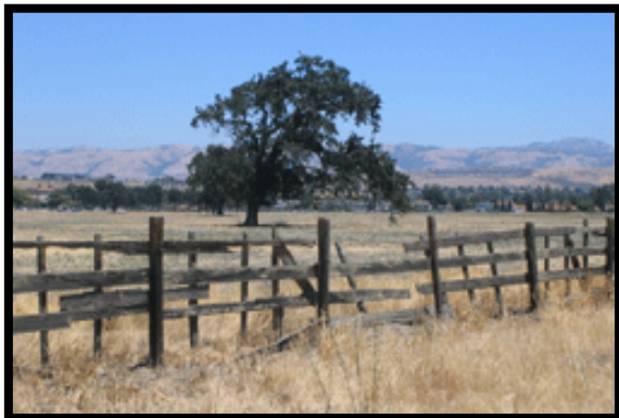
View of Martial Cottle Park

The park provides an extraordinary range of activities and learning opportunities for visitors: arboretum tours, pop-up nursery sales of native plants, talks on edible and native plants, a Master Gardeners Spring Garden Market, and a DIY Lawn Conversion (to native plants) workshop.