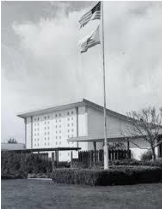
Samuel Ayer High School in Milpitas 1956-1980