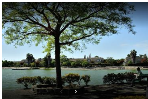
Hidden Lake Park

While most of the articles will focus on the parks that are named for people, Milpitas pioneers and supporters of Milpitas recreation and good governance, this month's mini-feature tells you about a truly "hidden" park and what fun it could be to find it.