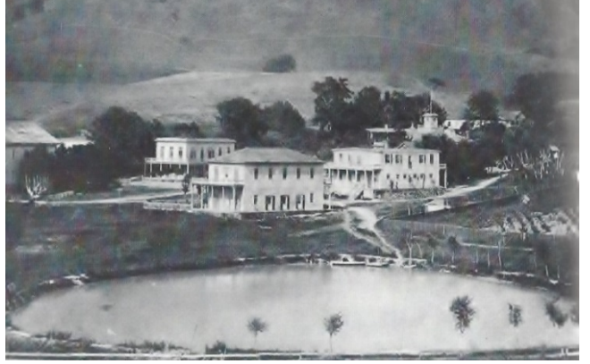
Warm Springs Resort in 1860

The meeting will be held on Wednesday, June 10<sup>th</sup> at 7 pm in the Community Room (auditorium) of the Milpitas Library, 160 N. Main Street.