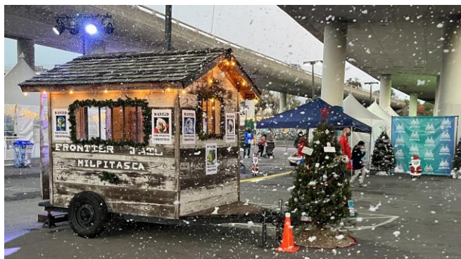
The city-provided false snow falls on the Frontier Days Rolling Jail at the Holiday Magic site.