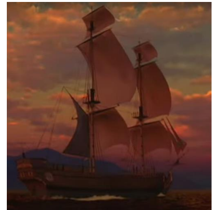
Sailing ship of the kind that brought early settlers and then the Gold Rush population to the San Francisco Bay Area

Our special presentation will more narrowly focus on the “early” history of San Francisco Bay, with a brief retrospective of how it was formed (there were radical geological changes), and then a more extensive history of the influence of human habitation – the millenia of aboriginal natives followed by slow Spanish colonization and then the very sudden changes of the California Gold Rush.