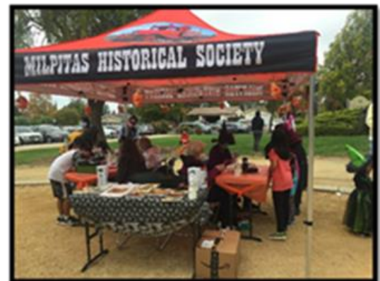
Last year's Craft Booth, where children enjoyed making their own Halloween objects, such as lollipop "ghosts."

We hope members can bring their families and enjoy these and the many other treats, games, and music that this year's Pumpkins in the Park festival will offer.