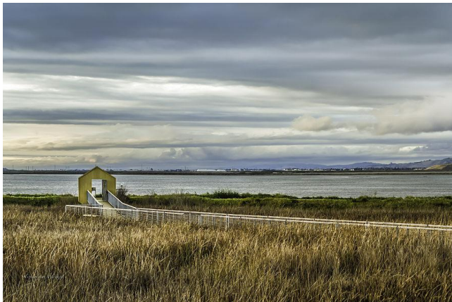
Alviso Marina County Park