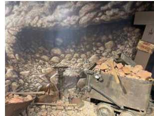
Mining site at the old New Almaden Mine

The New Almaden mines are the oldest mines in California and were one of the most productive mercury mines in the country. The settlers discovered the mines because they noticed that the indigenous Ohlone people utilized the area for its cinnebar, the bright red mercury ore that they used in the production of paint.