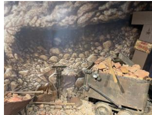
Mining site at the old New Almaden Mine

The New Almaden mines are the oldest mines in California and were one of the most productive mercury mines in the country. The settlers discovered the mines because they noticed that the indigenous Ohlone people utilized the area for its cinnebar, the bright red mercury ore that they used in the production of paint.