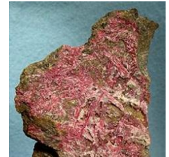
Specimen of cinnabar ore from the mine

We will have social time afterwards (as we usually do after the meetings), so you can catch up with friends and find out what's going on. Masks are no longer required to enter the library, but the county still requires that no food be served at these meetings. We hope to see you there!