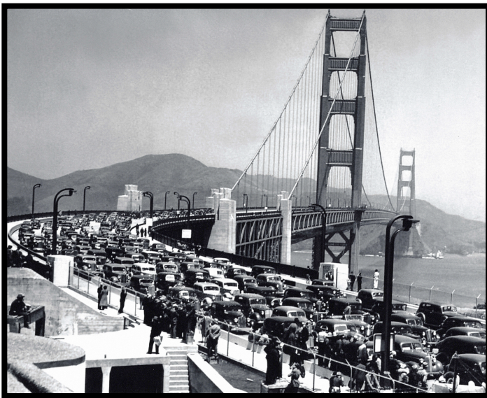
The Golden Gate Bridge on Opening Day, May 27 th , 1937

Our October meeting will take place at 3:00 pm on Wednesday, October 11, in the Multipurpose Room (Auditorium) of the Milpitas Library to see if it is a more convenient time now that most of us are retired and perhaps not comfortable driving at night. We'll ask you about this at the meeting and see what you think about meeting at this new time.