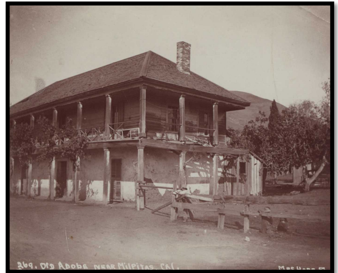
Alviso Adobe, early 1900s