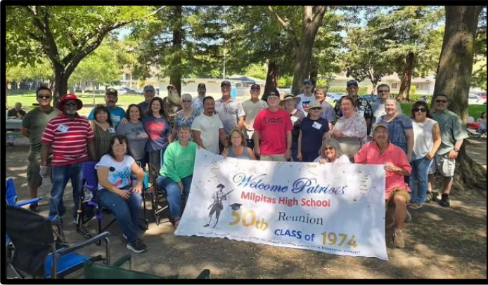
Class of 1974 Picnic in Murphy Park on Sundy, August 25th