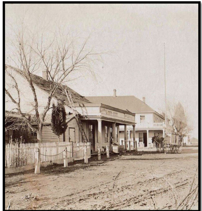
General Store/Saloon and Milpitas Hotel at the intersection of Oakland Road (Main Street) and Alviso Road (Serra Way).