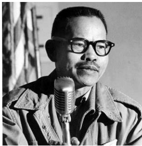
Larry Itliong Workers Union (UFW).

However, in an unprecedented move, the city rejected the PRCRC's suggestion of the Vennum name and made the decision to name the park for Larry Itliong (1913-1977), a Filipino-American labor leader who was important in organizing Filipino farm labor.