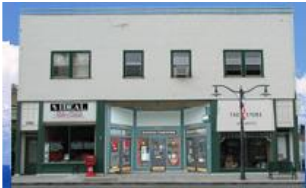
The Niles Essanay Film Museum

The next meeting of the Milpitas Historical Society will be held on Wednesday, November 13, at 7:00 pm in the Community Room (auditorium) of the Milpitas Library, 160 N. Main Street.